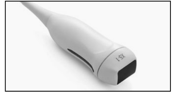
Picture of a transducer as used for the echocardiogram

There is a mirror on the wall that will enable the patient to look at the screen as the echo is taking place.